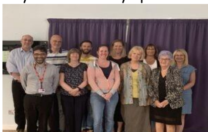
Governors from left to right: -

I have a long association with the school; I was a pupil here myself, my son also attended Trimley St Mary and my wife worked here as a Teaching Assistant for many years. Trimley St Mary Primary School is very special to me. I